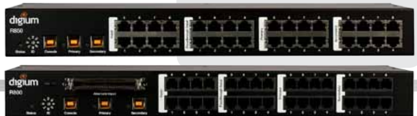
Digium R850 (top photo) and R800