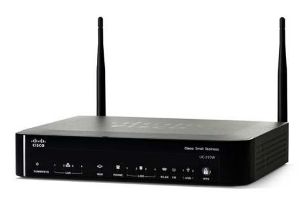
Figure 1. Cisco Unified Communications 320W