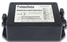
011375 Network Dual Door Strike Relay