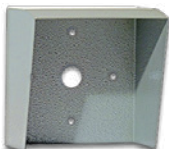
011188 Outdoor Intercom Shroud