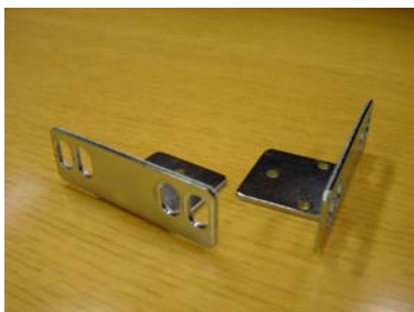
Rack mount brackets