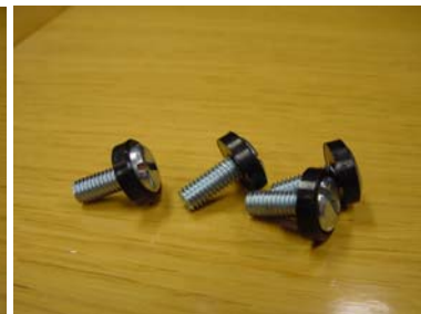
Rack mount bolts (not supplied)

Note: For the Vega 400 there are left and right handed rack mount brackets.