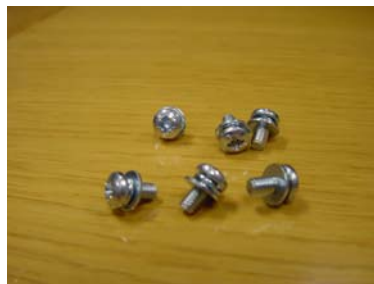
Bolts with washer and lock washer