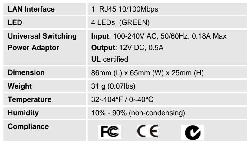
TABLE 5: HT701 HARDWARE SPECIFICATION

The table below lists the hardware specification of HT701.